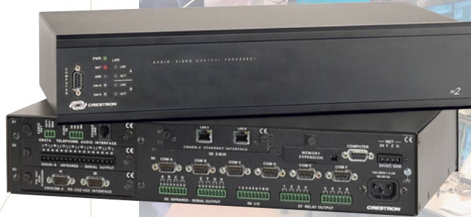
AV2 with optional card cage and expansion cards

The AV2 is a completely new solution-driven control technology that's also a network information control system. It's the budget-conscious solution for even the most complex control applications like media help desks, videoconferencing, distance learning, and entertainment facilities.